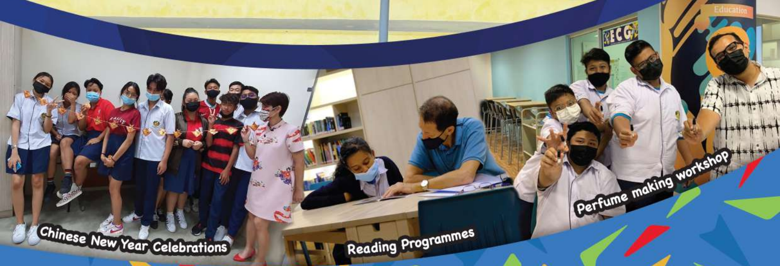
Chinese New Year Celebrations