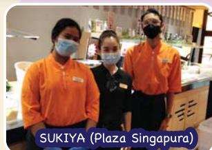
SUKIYA (Plaza Singapura)