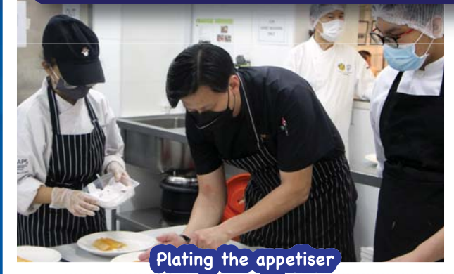
Plating the appetiser