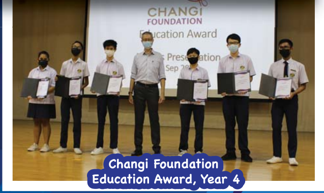
Changi Foundation Education Award, Year 4