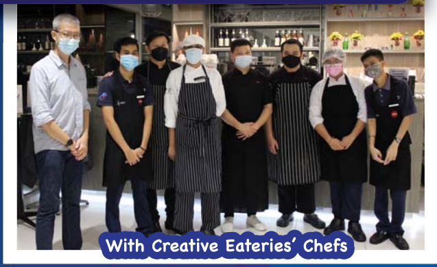
With Creative Eateries' Chefs