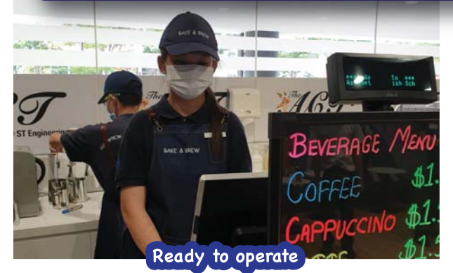
Ready to operate