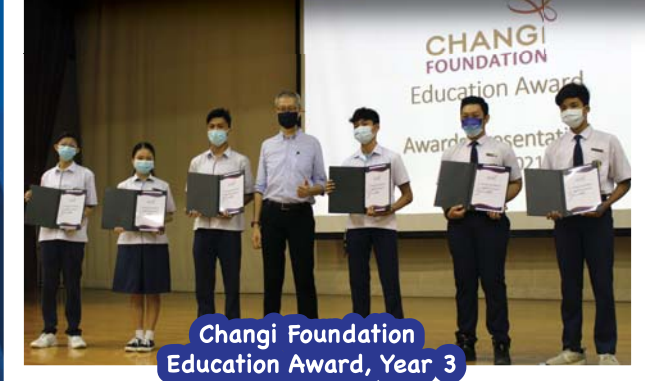
Changi Foundation Education Award, Year 3