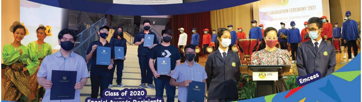
Class of 2020 Special Awards Recipients