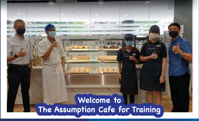
Welcome to The Assumption Cafe for Training