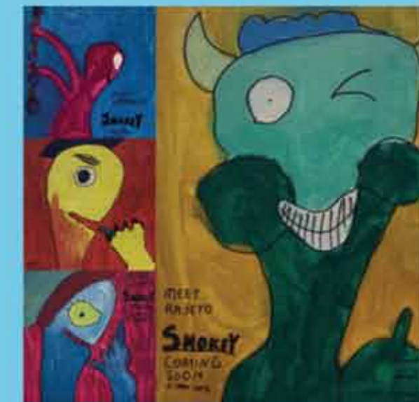
XANDYR QUEK, 2S1